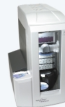
AutoStar II True performance for large, complex publishing jobs.