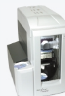
Protégé II Large capacity performance with room to grow.